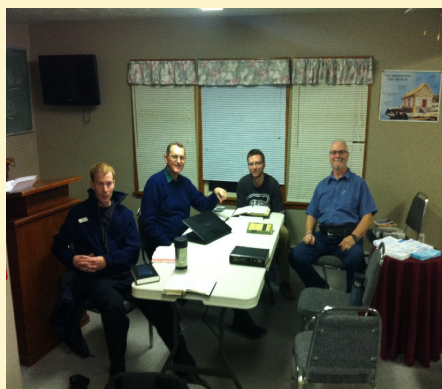
Leadership training in New Brunswick

of these churches, Al is prepared with the kind of lessons they need to encourage them to persevere in faith through the loneliness and difficulties that are part of living for the Lord in their communities. Many have found it nearly impossible to find a preacher willing to move to such an area, or to work with a church in such conditions.