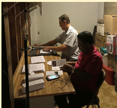
Preparing literature for distribution

All our books and tracts are given free to missionaries and mission churches thanks to contributions from caring Christians in various places. Proceeds of literature sales