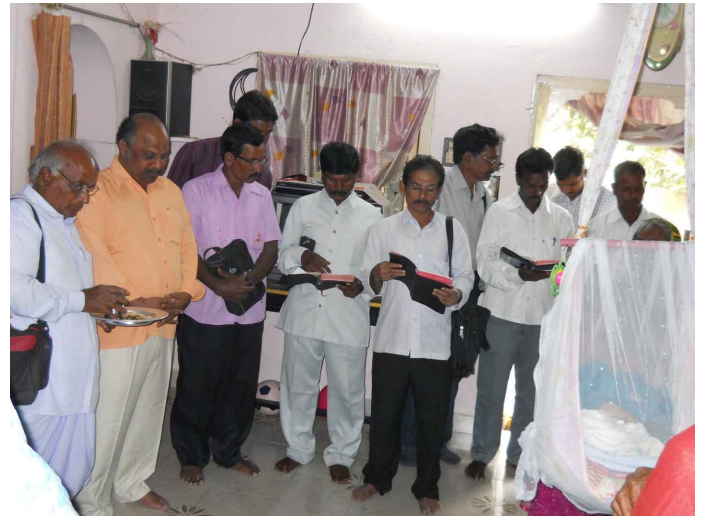
Preparing to serve the Lord's supper in a house church in India.

Introduction to Old Testament Books: The Content Purpose and Importance of Each Book in the Old Testament is the seventh book published by A. L. Parr. Here is clear discussion of how each Old Testament book fits into God's complete revelation. With a wide variety of features this 332-page text is a resource that you will use in every study of the Old Testament. An outline of each book shows the message and character of the book at a glance. Background and selected verses of each book are only some of the information you need in your study of God's word.