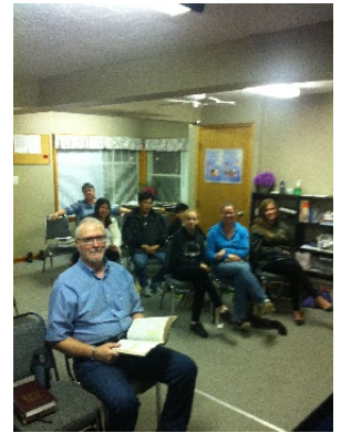
One-third of the Riverview, N.B. church

We still are looking for someone - perhaps a team of two or three families - to move to the Moncton area to help a small but well-established church. The current preacher, who is leaving this summer to further his education, has done a lot of evangelization and promotion in the local communities. In the past two months two souls have been baptized into Christ who previously had no connection to anyone in the church. Studies are continuing with others from community contact. It is a good work for someone with a missionary heart. Who do you know that might be interested in asking for more information. As we have previously stated, Sybil and I are prepared to stay there for a couple of months if necessary to help a new family get settled.