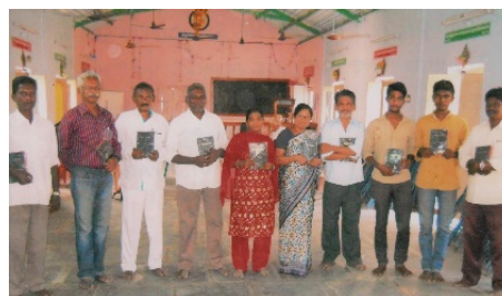
Students who scored 95% or better on first KRPTS exams