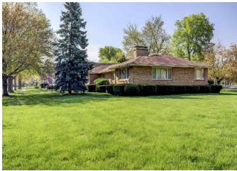
Our new home in Lincoln

The rigors of our move and the preparation of the farm for sale resulted in my losing track of time. I knew in mid-February that this report was due in two weeks, and now it is already “the ides of March.”