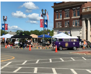
Farmers' market in Houlton, Maine

The church of Christ in Lincoln is our new home church and base of our mission operation. They began financial support in January to complement the great moral support and verbal encouragement they have given us for a long time. The brethren asked me to begin a weekly newspaper column in January. The long-running “God Has Spoken” series now appears in the Lincoln Courier every Friday. It began in 1987 and has previously appeared in newspapers in River Falls Wisconsin, Jacksonville Texas and Harrisburg Arkansas. It is one of the offerings listed on our web site. We will include it in local papers to complement the work of mission churches in the U.S. and Canada. You may read each week’s column at www.acts1541.org/ghs.pdf .