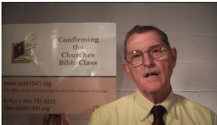
Screen shot of May 1 class

We have been attending community functions to meet people in our new hometown. We've had several lengthy and profitable conversations, but the first couple we met at an American Legion dinner live only two blocks from us. We agreed to spend more time together. With the warmer weather, and people out more, we have met more of our near neighbors. When the weather is more predictably suitable we plan to have a back yard meet-and-greet cookout.