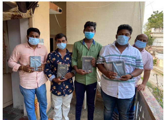
New Bibles to new KRPTS students

International Bible Academe. We are still seeking to replace some lost support for the “India Evangelism” work of T.V. Samson Raj in Hyderabad. I have been designing a web page for the purpose, and contacting churches. Brother Samson serves three churches (all of which he planted) ranging in size